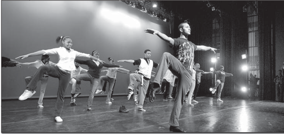
Ailey Trio